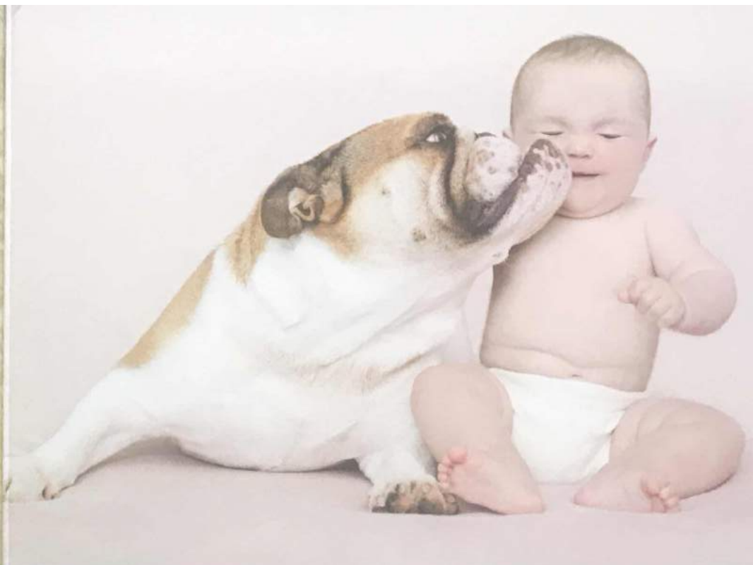
Na lenáos íňš-eyá héčhuṅpi.