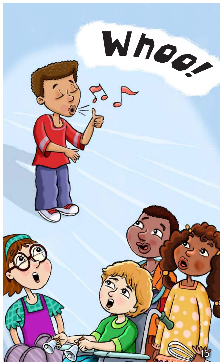
Walter Tries to Whistle | Shared Reading