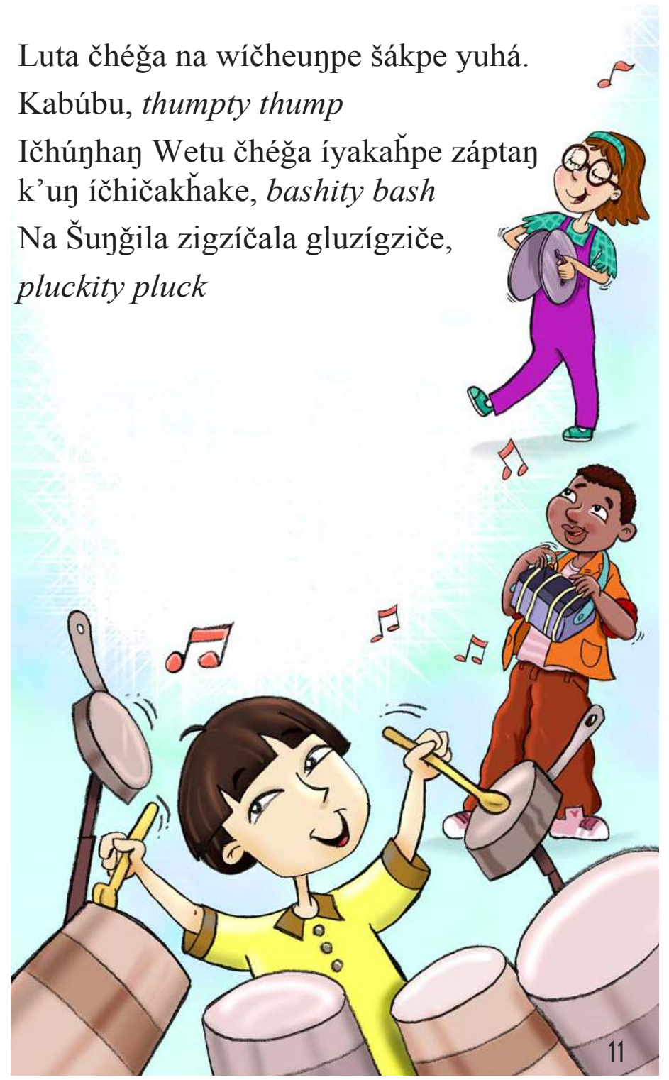
Walter Tries to Whistle | Shared Reading