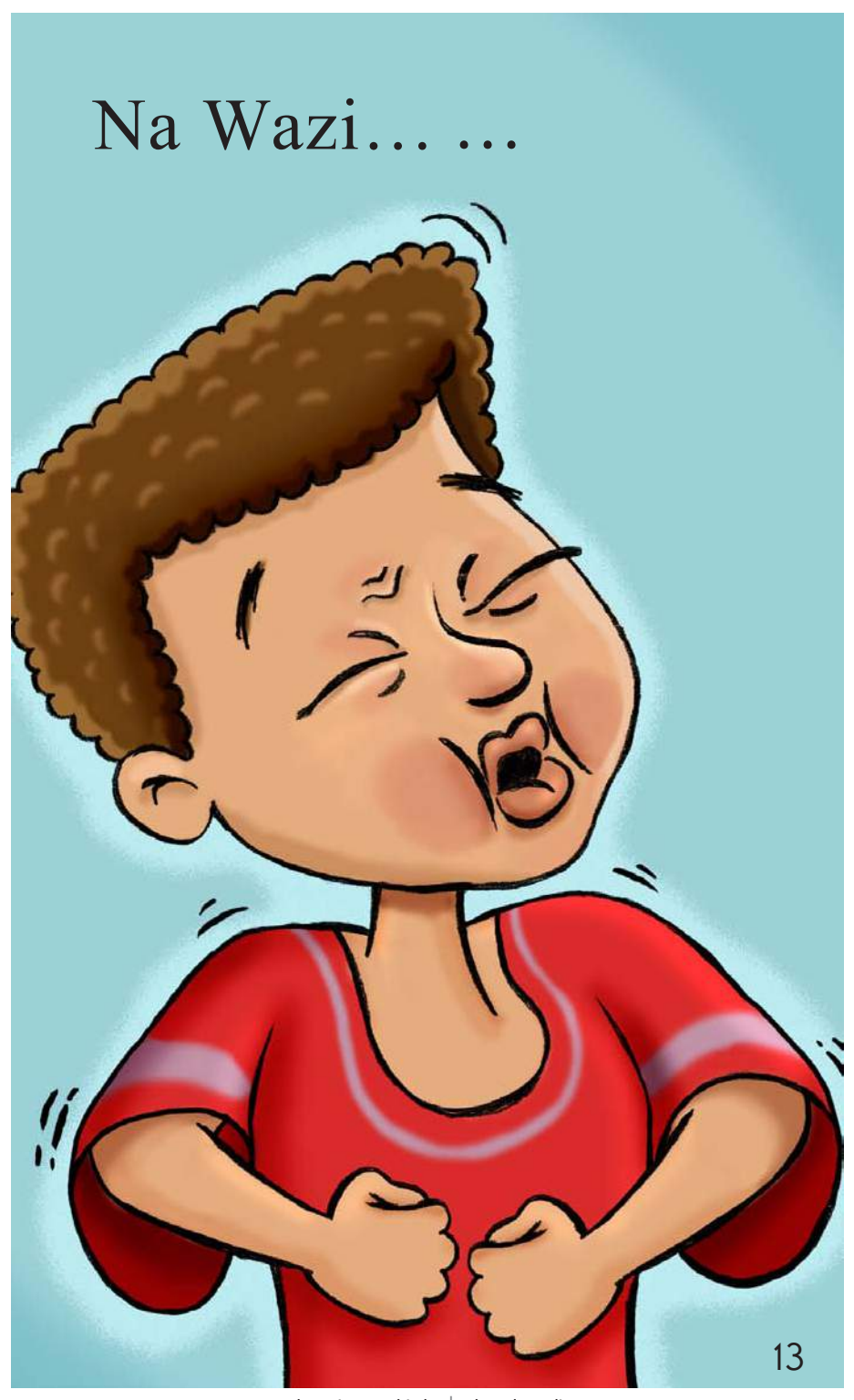
Walter Tries to Whistle | Shared Reading