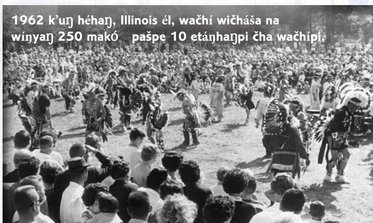
1962 k'uj héhaŋ, Illinois él, wačhí wičháša na wíŋyaŋ 250 makó pašpe 10 etáŋhaŋpi čha wačhípi.

Wačhípi wičhóħ' aŋ kiŋhán eháŋnitaŋhaŋ hiyú. Lehánl, Khéya Wíta Makħóčhe él ówaŋčaya wačhípi yuhápi. Na tuwé k'éyaš úpi okíhipi.